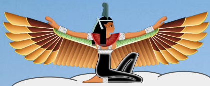
(Above) The Goddess representation of Ma'at

Egyptians were polytheistic, believed on upholding the principle of Ma'at (harmony), and centered their lives around Magic, the harnessing of natural powers to achieve a certain goal.