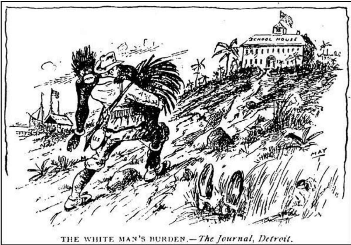
THE WHITE MAN'S BURDEN.— The Journal, Detroit.

*The building says "schoolhouse" *The white man is carrying a person *The canteen says U.S.